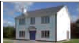
Ballinlass, Ballinamore Bridge

new four-bedroom two storey house with prime location at Tully, Ballygar and a price tag of just €169,000 open to offers. Contact David Moran at (090) 66 24531.