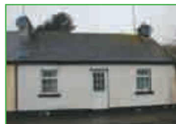
Attractive three bedroomed bungalow at Henry Street, Roscommon.