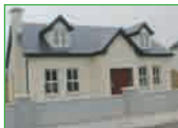
Attractive three bedroomed dormer bungalow located at Ardnanagh.