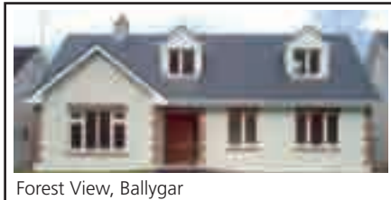
Forest View, Ballygar