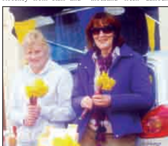
Daffodil Day was a big success in Elphin.

Roscommon Driving School Tel. (090) 66 61102