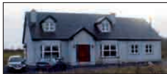
Lissavrugy, Newbridge, Co. Galway, circa 3,500 sq. ft. five bed roomed dormer bungalow on a large site. Selling to every offer in excess of €150,000.

For further information, please contact Pat Hughes & Co. Ltd., Auctioneer & Valuer, 1 Abbey Street, Roscommon. Tel: (090) 66 27003 Fax: (090) 66 26296 or email phughes2@eircom.net.