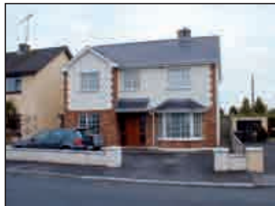
Attractive five bed roomed two-storey residence at Celtic Avenue, Roscommon. Hughes & Co. Auctioneers, are accepting every offer in excess of €200,000.