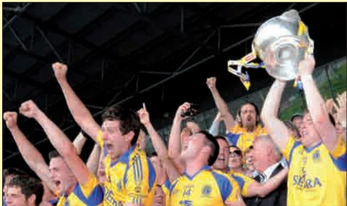
Roscommon team members celebrate with the Nestor Cup.

"We knew that it was a close, tense affair. When Sligo pulled back to level the scores we knew that it