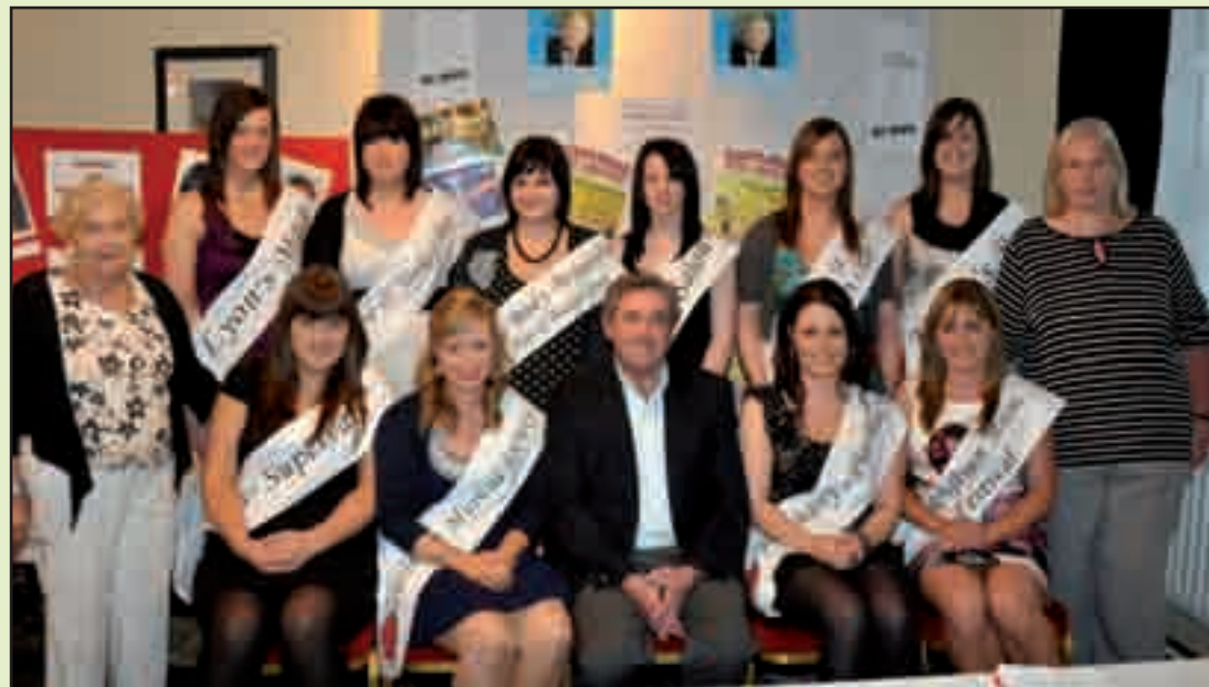
Castlerea Rose contestants pictured with committee members.

MAKE SURE TO RETAIN OUR 4-PAGE GUIDE TO CASTLAREA SHOW & FESTIVAL!