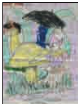
Abi Connolly Cloonkeen East Castlereagh Age: 4