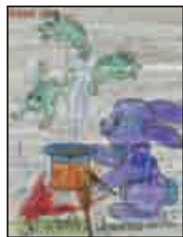
Abi Connolly Cloonkeen East Castlereagh Age: 4