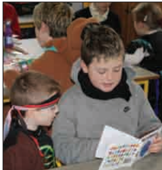
ABOVE: Two young readers pictured at the celebrations to mark World Book Day in Abbeycartron NS, Elphin recently.