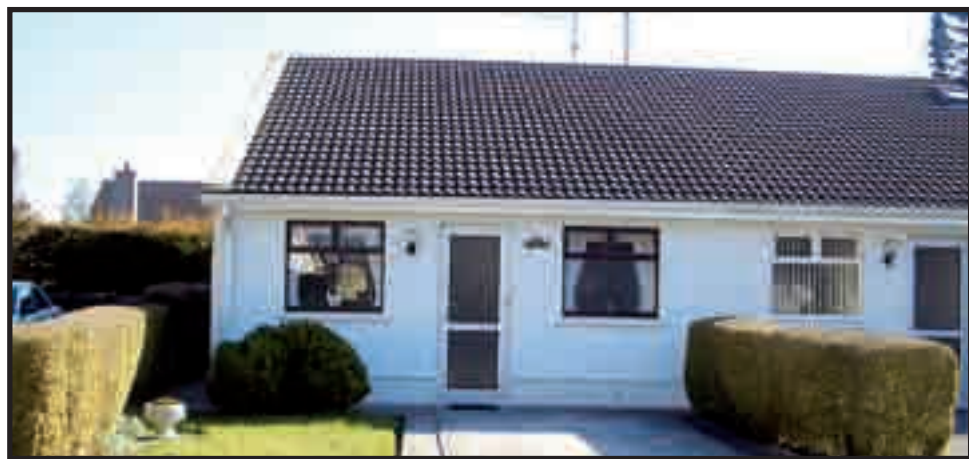
Castle Park in Roscommon town .. an attractive and private rear garden, keenly reserved for immediate sale.