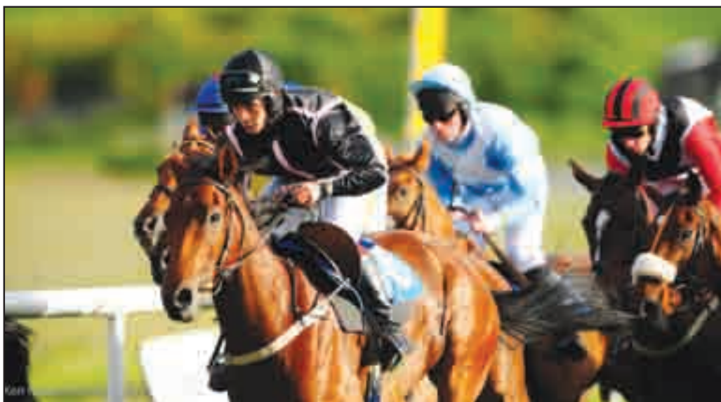
Action from Roscommon Races earlier this week.

A Dawn Mass will be held on Sunday, June 20th in Ballinastack Children's Burial ground, Glenamaddy at 4 am. All welcome.