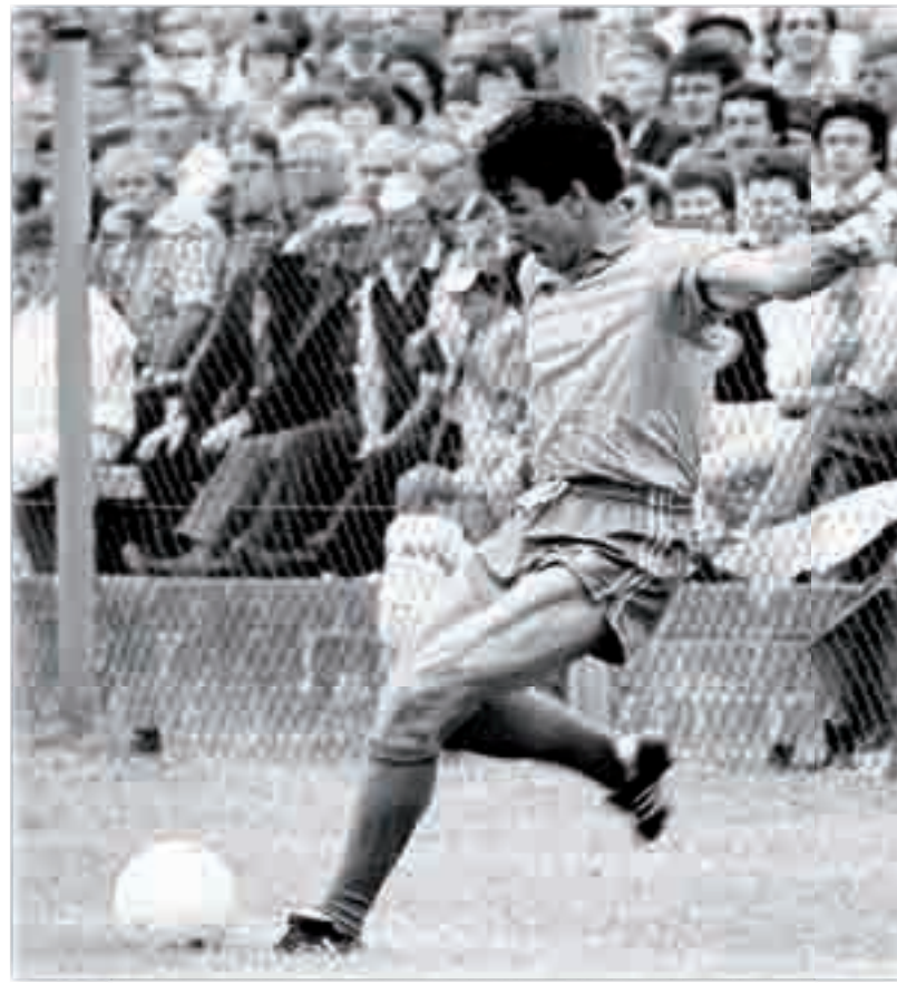
The late Dermot Earley pictured in action.

I have no doubt that the spirit of the great and so greatly lamented