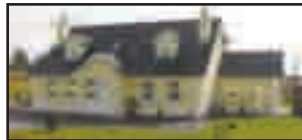
KILMURRAY, CASTLEPLUNKETT, CO. ROSCOMMON

Luxurious 4 bedroom residence excellently maintained by its present owners. Viewing highly recommended.