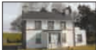
BOHO, BALLINTUBBER, CO. ROSCOMMON

SATURDAY 22ND MAY 2010 - THE ABBEY HOTEL, ROSCOMMON