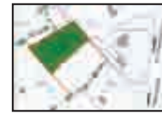
CLASHAGANNY, CO. ROSCOMMON

Prime site containing c. 0.57 acres with Full Planning Permission for bungalow. No occupancy restriction. Excellent views and located beside countryside public house.