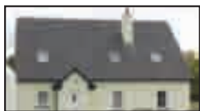
KNOCKMASCASHILL, CREGGS, CO. GALWAY

Spacious six bedroom residence finished to the highest of standards and standing on c. 17 acres of mixed quality lands