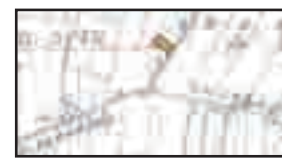
MOUNT KELLY, GLENAMADDY, CO. GALWAY

Prime site with the benefit of Full Planning Permission for a bungalow residence c. 1.733 sq. ft and garage c. 506 sq. ft located c. 1 mile from Glenamaddy just off the Creggs road