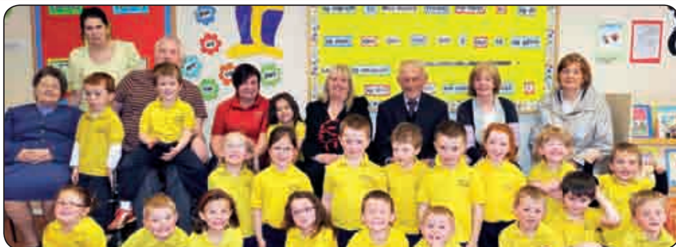
Students from the Gael Scoil de hÍde, Roscommon pictured on Wednesday morning last with their grandparents, they were invited in to sit with the children for an hour.