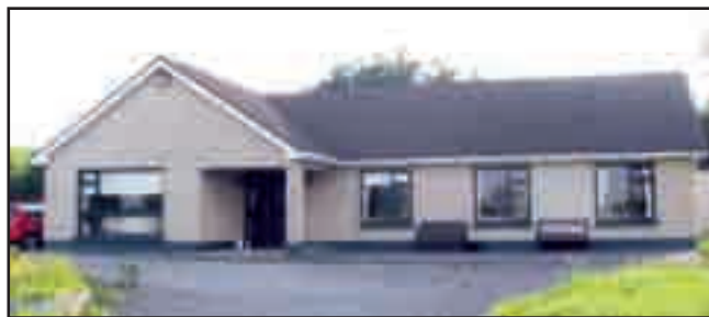
Ballymacfrane, Donamon, is currently for sale, priced in the region of €165,000.

The bungalow stands on a site of approximately one acre and is adjacent to Clooneycolgan church and Lisansky National School. It's priced to sell and boasts spacious living accommodation throughout, with a large double garage to the rear. Accommodation includes a porch, reception hallway, sitting room, kitchen, dining