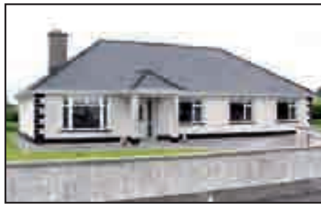
Fairview, Lisalway, Castlerea priced in region of €145,000

room, utility room, four bedrooms, one of which is en-suite and family bathroom. The first floor is open plan. To make an enquiry or arrange a viewing, simply call Ivan Connaughton on (090) 66 34021.