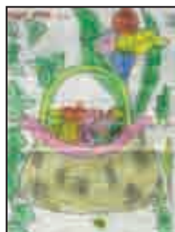
Ailbhe Donnellan Ardsallagh Beg Roscommon Age: 6