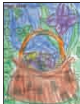
Ciara Healy Newtown Roscommon Age: 4