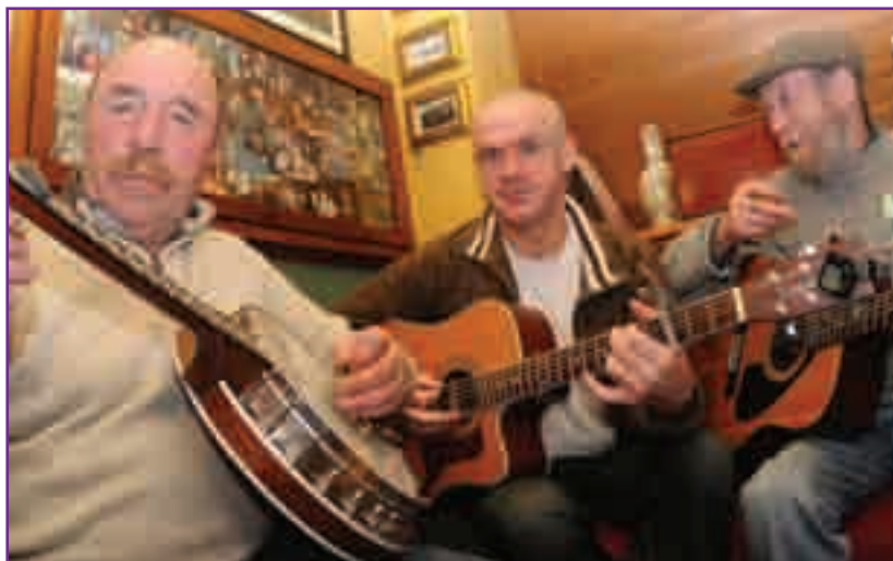
A session in Clarke's in Ballyhaderreen last weekend, during the very successful Co. Fleadh.

paintings containing texts from a bombarded mass environment, such as media, health warnings, advertisement, political posters, policies, etc, which act as a prescribed format for living but instead generate products of anxieties, fears and phobias.