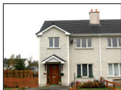
Coillte Bo in Loughglynn has been reduced in price to €135,000

A home at Coillte Bo in Loughglynn has been reduced in price to €135,000 for a quick sale.