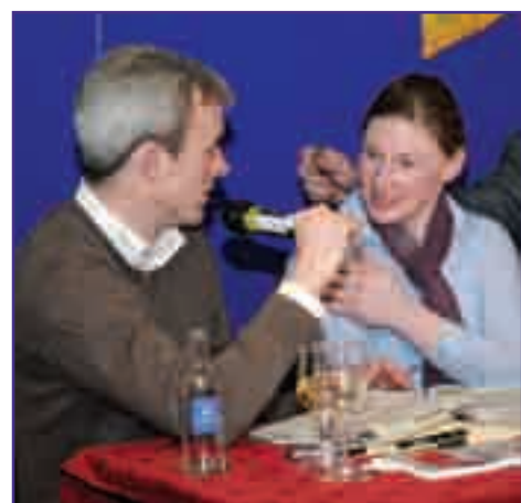
Ruby Walsh and Nina Carberry pictured at the Cheltenham Preview Night in the Abbey Hotel, Roscommon last night (Wednesday).