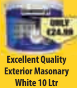
Excellent Quality Exterior Masonry White 10 Ltr Best Value Around