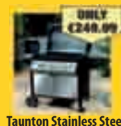
Taunton Stainless Steel Gas Bbq (Solid Cast Burners)