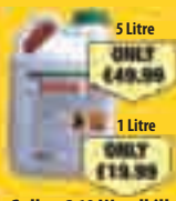
Gallup 360 Weedkiller