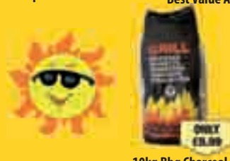
10kg Bbq Charcoal