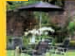
Bermuda 6 Piece Set