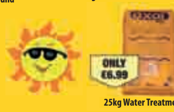
25kg Water Treatment Salt