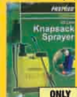
Knapsack Sprayer 20 Litre