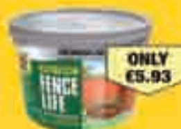
Ronseal Fencilife 5 Litre All Colours