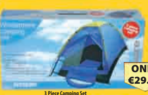
3 Piece Camping Set