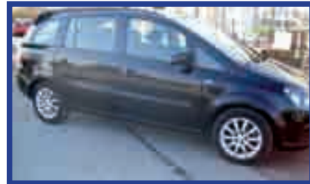
Opel Zafira 1.6CLUB €13,750