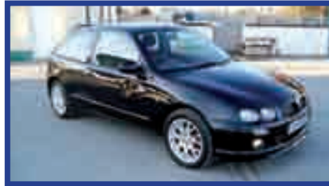
2004 MG ZR 105 3DR PLUS 03MY €3,350