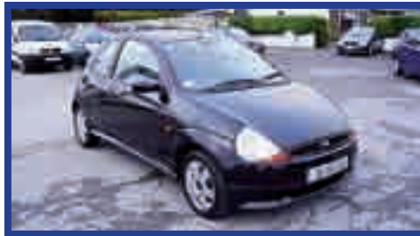
Ford KA COLLECTION BODY KIT €5,750