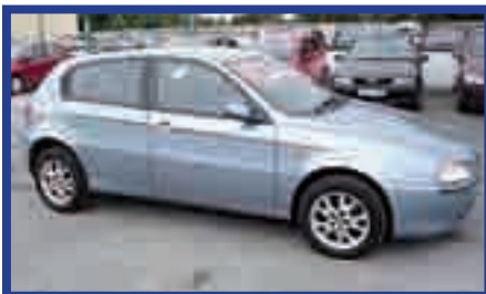
2004 Alfa Romeo 147 1.6 LUSO €5,750